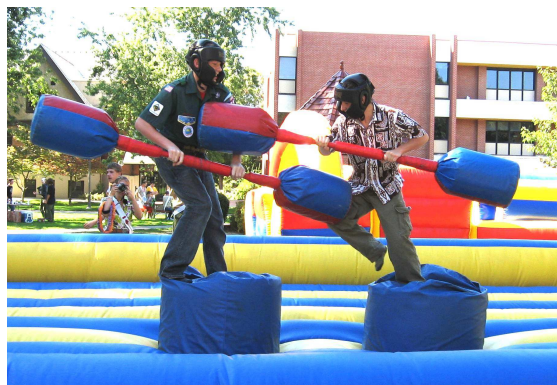
Saturday Afternoon Games