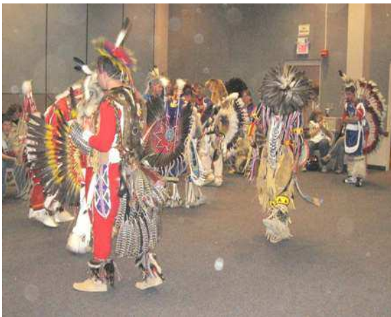
Conclave Pow Wow