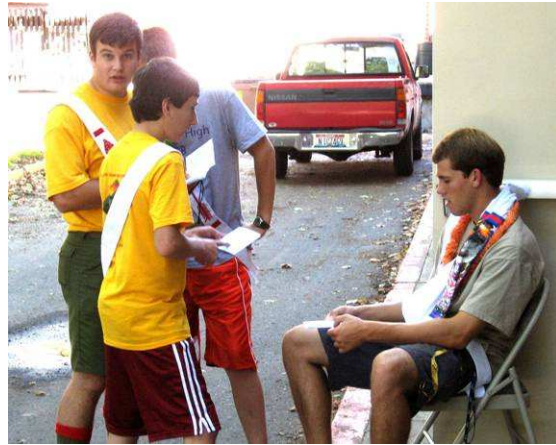
The Usual Suspects